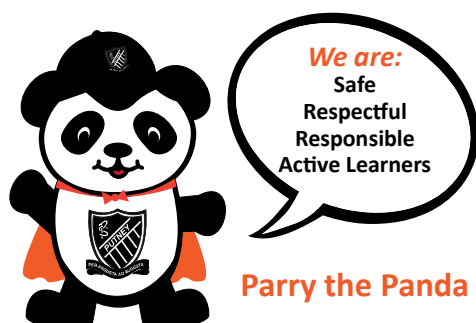
Parry the Panda

T 02 9807 6255 E putney-p.school@det.nsw.edu.au W www.putney-p.schools.nsw.gov.au