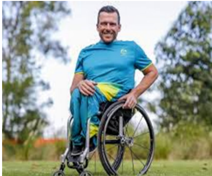
Kurt Fearnley is indeed an inspirational Australian.

Kurt believes that “People with disability are entitled to the same respect, independence and choice as others. We need to talk honestly about the barriers in society that prevent this and work together to break them down.”