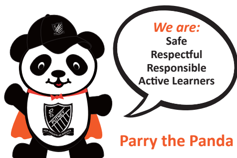
Parry the Panda