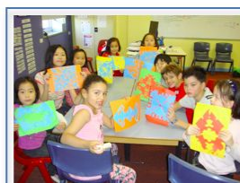
Arts and crafts