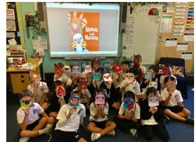
2C loved making their Alpaca masks!