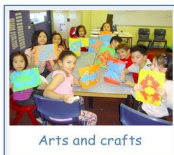
Arts and crafts