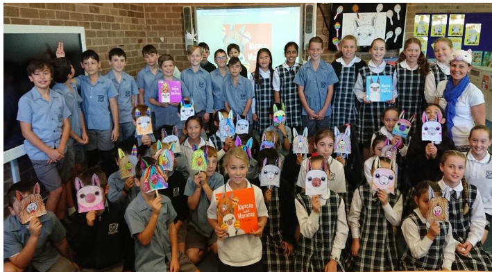
Buddy classes 2F and 5F enjoyed National Simultaneous Story Time in the Library!