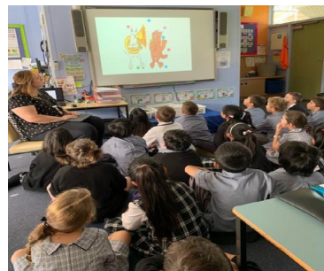
3R read the book online!