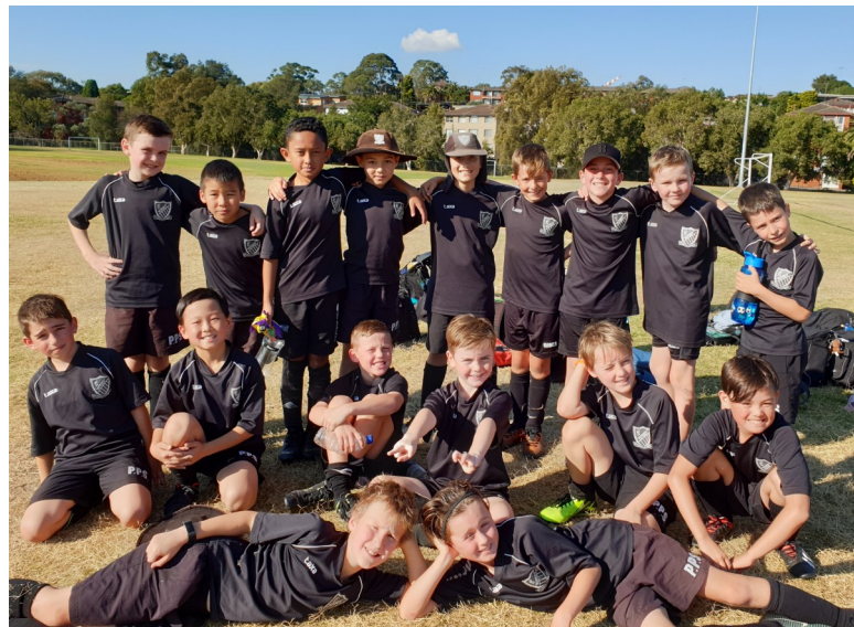
Junior boys B soccer team (in front) had a win last Friday while Junior boys A soccer (in back) unfortunately had a loss.