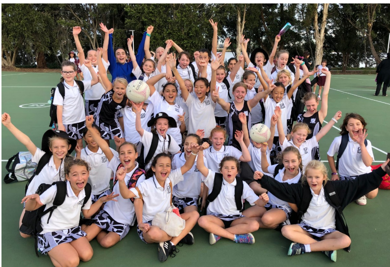
All of our netball teams have won at PSSA for the last two weeks. Well done Girls!