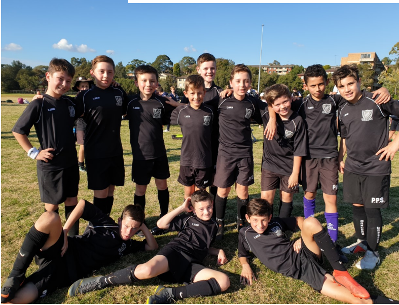
Senior Soccer boys had a great win last Friday